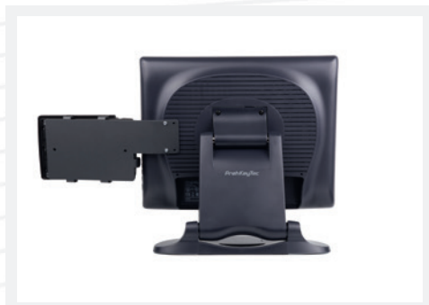
MTE 15 Touchscreen, MCI 30 cashdesk keyboard