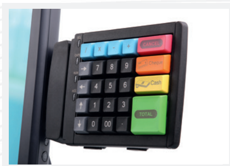
MTE 15 Touchscreen, MCI 30 cashdesk keyboard