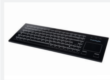
GIK-2700 for industrial applications