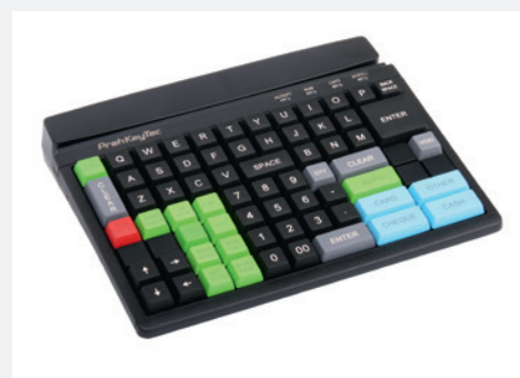
MCI 84 with card reader for supermarket