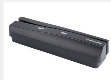
ML2 module with OCR- and 3-track magnetic stripe reader