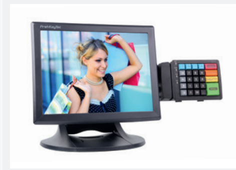
MTE 15 Touchscreen, MCI 30 cashdesk keyboard