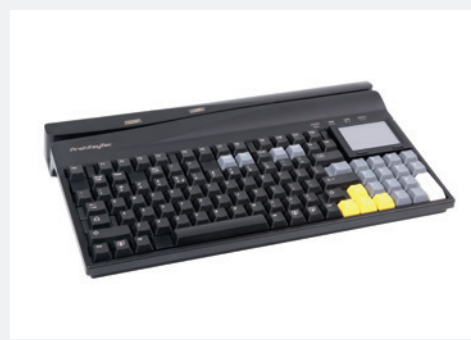
MCI 111 A for airline

» Intelligent mechatronics solutions for reliable data entry systems in the area of point-of-sale and point-of-service applications «